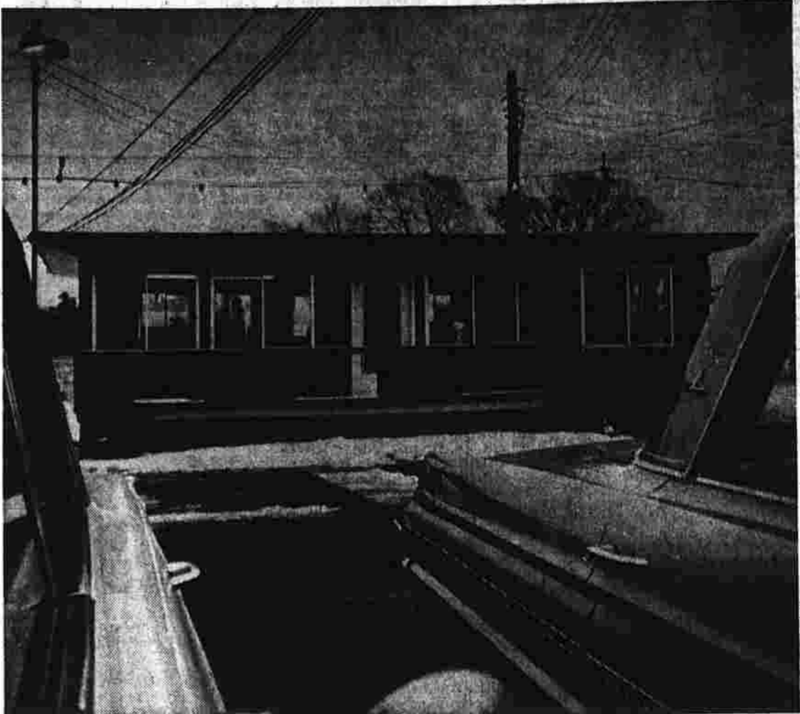
New sales office headquarters at the Manchester Motor Sales Inc. Used Car lot at 512 W. Center St. is shown above. The 45 foot by 20 foot building, which houses four individual closing rooms and a separate office for the sales manager, Raymond Dwyer, has its own heating plant and is air-conditioned. The exterior has a redwood finish with an interior decor of beige and mahogany wall paneling. Four salesmen and Dwyer also have new office furniture. The new building is a great improvement over the former 12 by 12 foot one-room former salesroom. A new neon sign and extended paving toward Hartford Rd. is planned for the near future, he added.